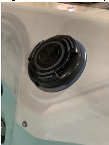
(Large Water Diverter)