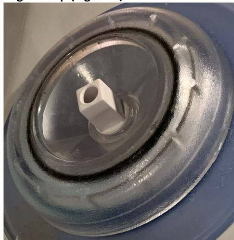
(Handle Removed to Show Original Clear Cap)